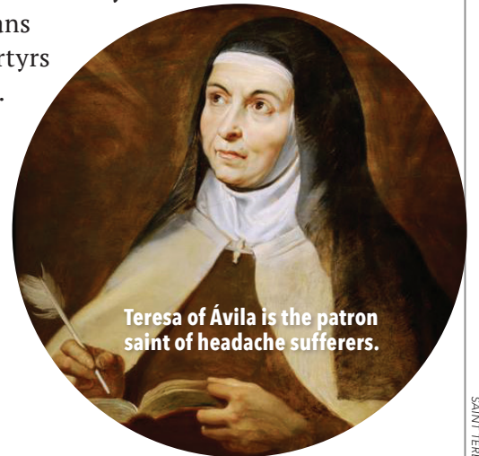
SAINT TERESA OF ÁVILA, PETER PAUL RUBENS

From Dear Padre: Questions Catholics Ask , © 2003 Liguori Publications